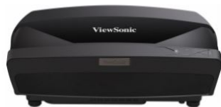
LS830 Full HD 4,500 ANSI Lumens Laser Projector

Thanks to advancements in projector technology and a gradual decline in projector prices, this option is more feasible than ever. If the advantages of projectors have swayed you into considering a purchase, the next step is to jump from the theoretical to the practical, in that you should decide which model is best for your needs.