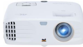
PX747-4K High Brightness 4K Ultra HD Projector

Given the advantages of projection, it make sense for just about anyone to consider. Not only are projectors great for those who want a more dynamic approach to home entertainment, as we discussed in this article, but they're excellent in business and education settings as well.